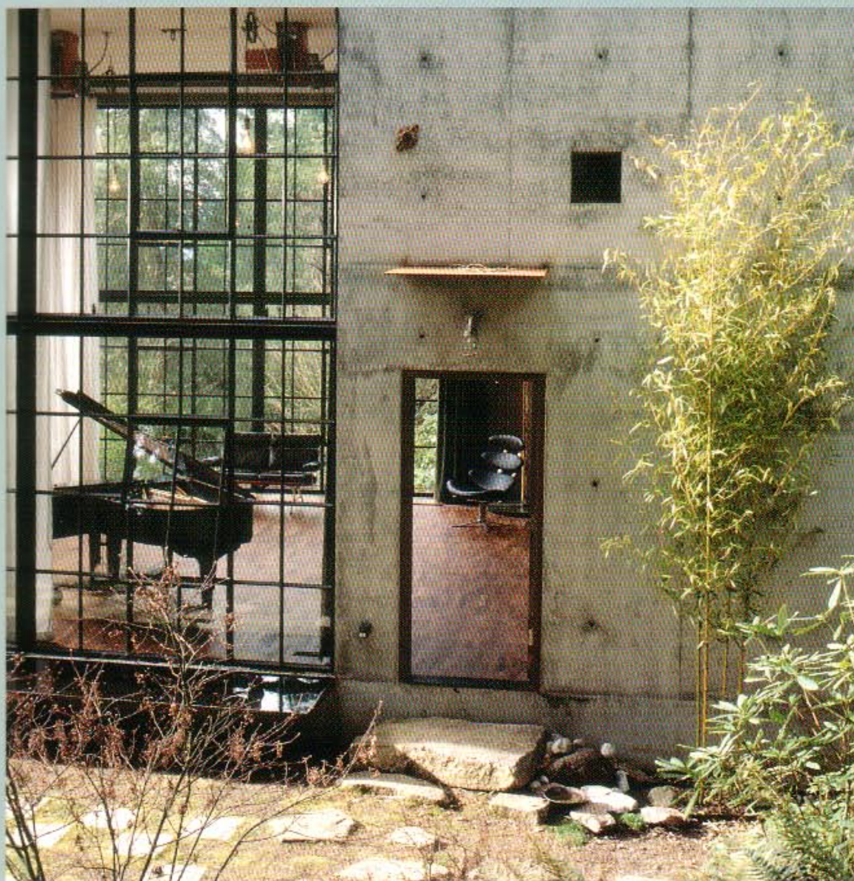
LEFT: Entry. RIGHT: Ample glazing merges the outside with the interior in this cast-in-place concrete cottage.

The form is essentially a cast-in-place concrete box intended to be a strong yet neutral background allowing complete flexibility to adapt the space at will. Inserted into the box along the south wall is a steel mezzanine that functions as an office. All interior structures, including the mezzanine, are made using raw, hot-rolled steel sheets.